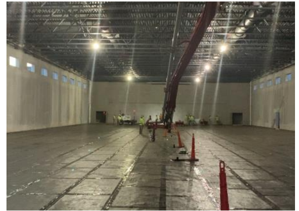
Auxiliary gym floor prepped for concrete (07/28/2022)