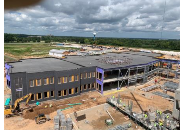
Aerial view of the East classroom wings (07/14/2022)