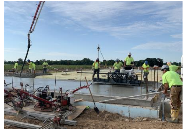
Fresh concrete getting poured for the maintenance building slab (07/19/2022)