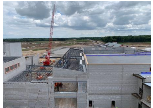
Aerial view of the spirit concourse and site looking South (07/14/2022)