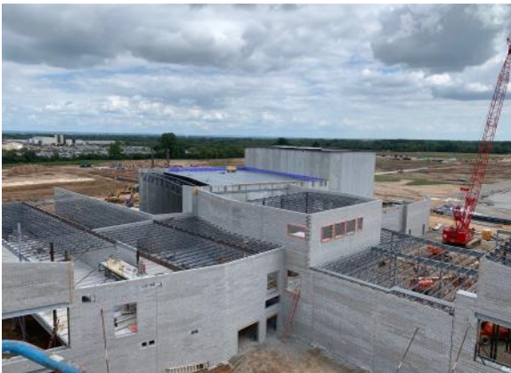
Aerial view of the auditorium and fine arts wing (07/14/2022)