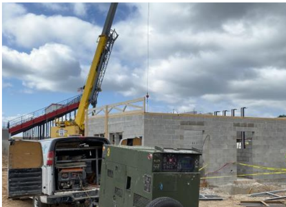
Roof trusses start to get set on the North concession stand (07/28/2022)