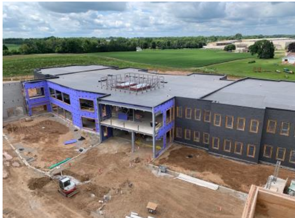
Aerial view of the West classroom wings (07/14/2022)