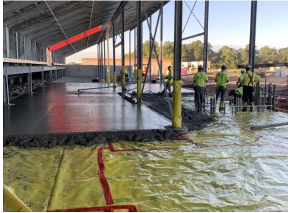
Concrete getting poured for storage area under foot-ball bleachers (07/26/2022)