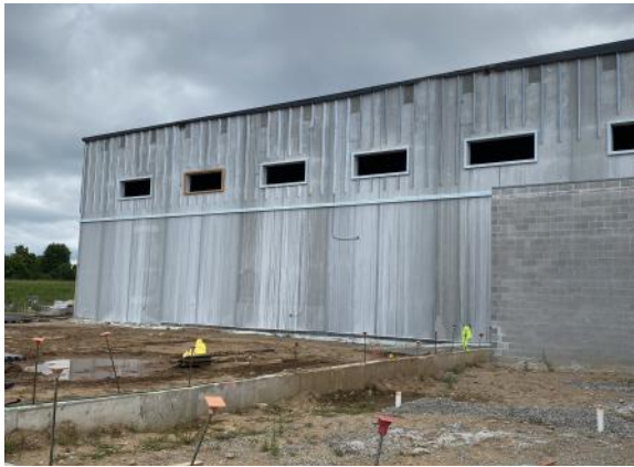
Exterior side of the auxiliary gym (07/27/2022)