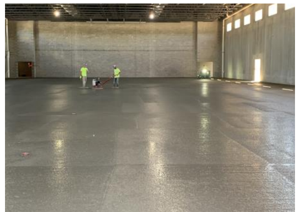
Completed concrete floor in the auxiliary gym which was all poured in one day (07/28/2022)