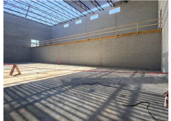
Completed competition gym floor, looking at future spot where bleachers will be installed (07/26/2022)